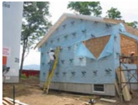
June 24: We have a roof!