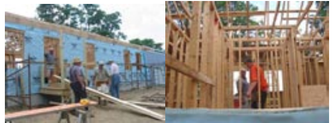
June 24: Men at work