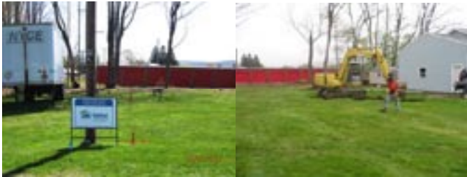
April 24 – 28: ground has thawed and excavation begins

Dateline, 18 Miles Avenue: We promised in our last newsletter to give you a progress report on our newest house in the Town of Oneonta. We hope you enjoy what you see (enough to join us)!