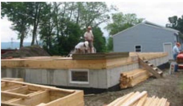
June 5: foundation is poured and deck work begins