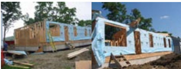
June 17 and 18: walls go up – now it looks like a house!

[On June 24] at the worksite, at about 3:00 p.m. the ice cream truck/vendor came by. We sometimes purchase some, but weren't going to yesterday - so the lovely lady driver decided to GIVE us each an ice-pop - being worried about our dehydration.