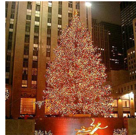
Rockefeller Center's 2008 Christmas tree in all its glory.

Here's an example of what I'm talking about. It's a reprint from the website for Scientific American ( www.sciam.com ):