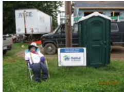
House building! – with visiting groups and friends from home...