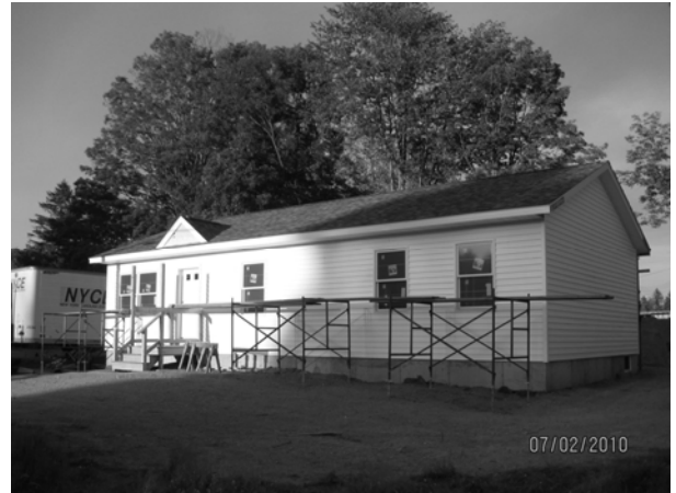
The house, shown at the end of the crew's last day – clearly, a good week's work!