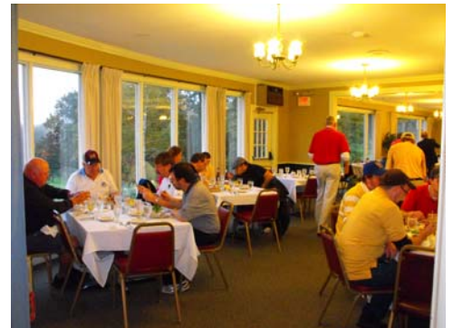
Happy diners after the tournament.