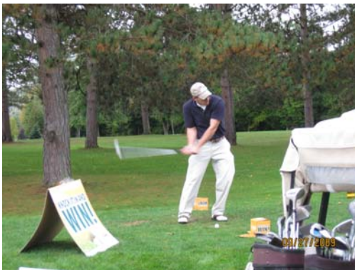
Taking a shot at the $15K Hole-in-One.